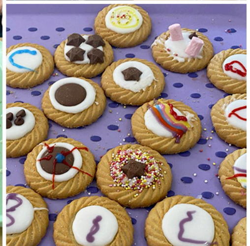
Who can resist an iced biscuit?